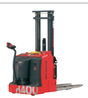
d400 EEx Electric pedestrian pallet stacker

The d100 EEx is in its element when it comes to the horizontal transportation of pallets and containers. With its extremely low unladen weight it lifts loads of up to 3000kg and is also ideal for operation in confined spaces.