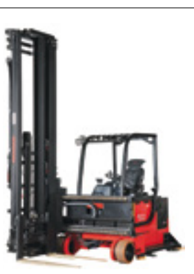
M7200 EEx Lateral reach truck

Lateral reach trucks are the answer for efficient pallet handling. The pivoting mast enables pallets to be place or picked to the right or left in narrow aisles.