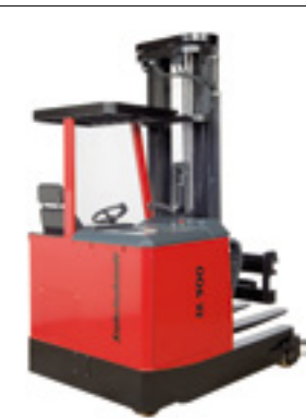
M900 4-way forklift

The M900 is the ideal forklift for those needing to handle long loads. It offers an enhanced level of operational flexibility thanks to its ability to be precisely steered and positioned in sideways mode. This 4-way truck therefore becomes a multiway truck with lift capacities up to 3000 kg and standard lift heights up to 7400 mm — the perfect machine to cope with long products.