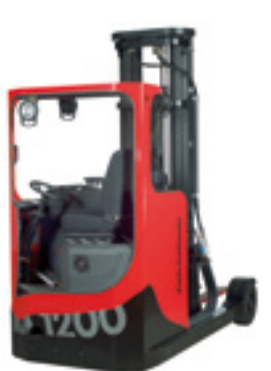
M1200 EEx Reach truck

Lift capacity up to 3000kg Lift height up to 7500 mm