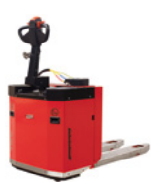
d100 EEx Electric pedestrian pallet truck

For the horizontal transport of pallets and containers up to 2000kg.