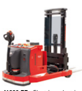
d1200 EEx Electric pedestrian reach truck

With lift capacities of up to 1250kg and lift heights of up to 5700mm the d600 EEx is ideal for operation in hazardous material stores and other Ex areas. Its solid construction guarantees extreme stability — a key safety feature.