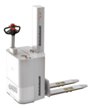
d400 GMP Electric pedestrian pallet stacker

For placing, picking, lifting and transporting pallets and containers. The chassis has an enclosed lifting column and stainless steel pallet forks. The encased battery and the fully enclosed hydraulic loop prevent contamination of the working area.