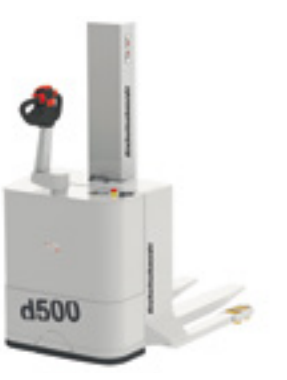
d500 GMP Electric pedestrian wide straddle stacker

For very stable transportation when travelling with loads such as barrels, also for use in cleanrooms. The design of the d500 GMP meets the exacting requirements of operation in cleanrooms and hygiene sensitive applications.