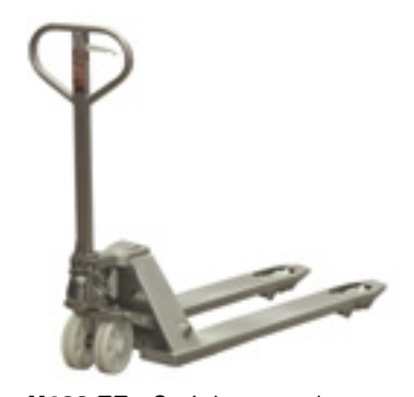
H120 EEx Stainless steel pedestrian pallet truck

For the horizontal transport of pallets and containers up to 2000kg.