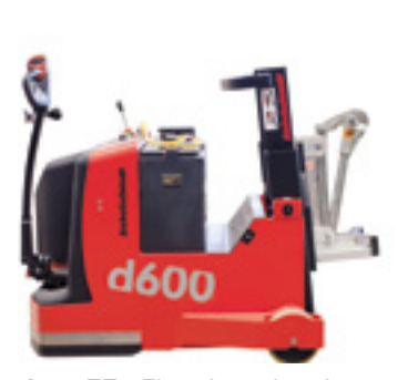
d600 EEx Electric pedestrian forklift truck

Lift capacity up to 2000kg Lift Height up to 5700mm