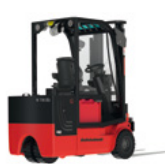
M700-3 EEx Electric 3-wheel counterbalance forklift truck

A compact and manoeuvrable 3-wheel forklift for universal application. The powerful front-wheel AC drive and electronic stabilising system ensure safe driving conditions and high throughput levels.