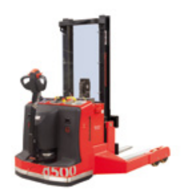
d500 EEx Electric pedestrian straddle stacker

Lift capacity up to 2000kg Lift height up to 5700mm