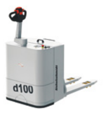
d100 GMP Electric pedestrian pallet truck

Many processes in the pharmaceutical manufacturing sector need to comply not only with explosion protection directives but also those of cleanroom operation to ensure that products are not contaminated. Sichelschmidt has addressed this demanding combination of Ex protection and cleanroom technology by developing a series of models that are GMP compliant. The cleanroom forklifts are also supplied in versions for operation in non Ex areas, for example in the semiconductor industry.