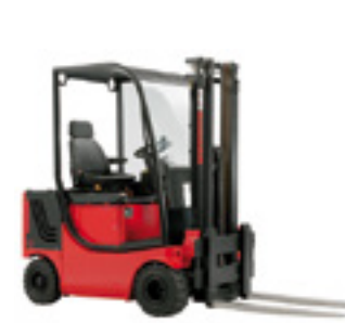
M700-4 EEx Electric 4-wheel counterbalance forklift truck

Lift capacity up to 2000kg Lift height up to 6000mm