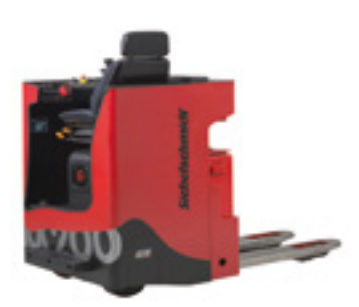
M200 EEx Electric side seat pallet truck

A salient feature of the d130-T EEx, which has a traction power of 3t, is its extremely compact dimensions. The stand-on driver station with back rest offers a high level of operator comfort particularly when longer distances need to be covered.