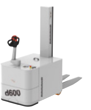
d600 GMP Electric pedestrian truck

For transporting pallets and containers as well as for use with a wide range of attachments. The chassis features an enclosed lifting column and stainless steel forks and fork carriage. The encased battery and the fully enclosed hydraulic loop prevent contamination of the working area.