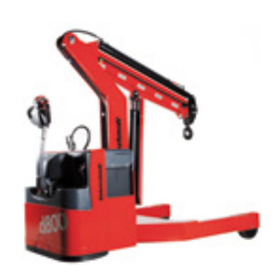
d800 Workshop crane

Whether you need to commission, transport, stack or store, there will be a model from Sichelschmidt's electric range to cope with virtually every materials handling requirement. The trucks are fitted with powerful ASM AC drives and Sichelschmidt's reputation over decades for the highest manufacturing standards guarantees a top quality product.