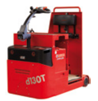
d130-T EEx Electric tow tractor

A salient feature of the d130-T EEx, which has a traction power of 3t, is its extremely compact dimensions. The stand-on driver station with back rest offers a high level of operator comfort particularly when longer distances need to be covered.